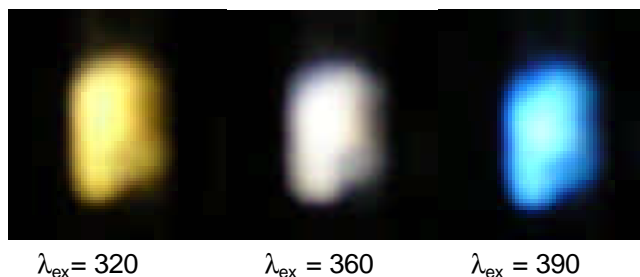
Figure 3: Emission colours as a function of the excitation wavelength

We also observed that the modification of the relative intensity between the two emissions is related to a specific location of the amine ligands on the surface of the particles. Interestingly, a selective excitation can lead to observe a yellow, blue or white emission, the latter one corresponding to the sum of the two previous ones (Figure 3).